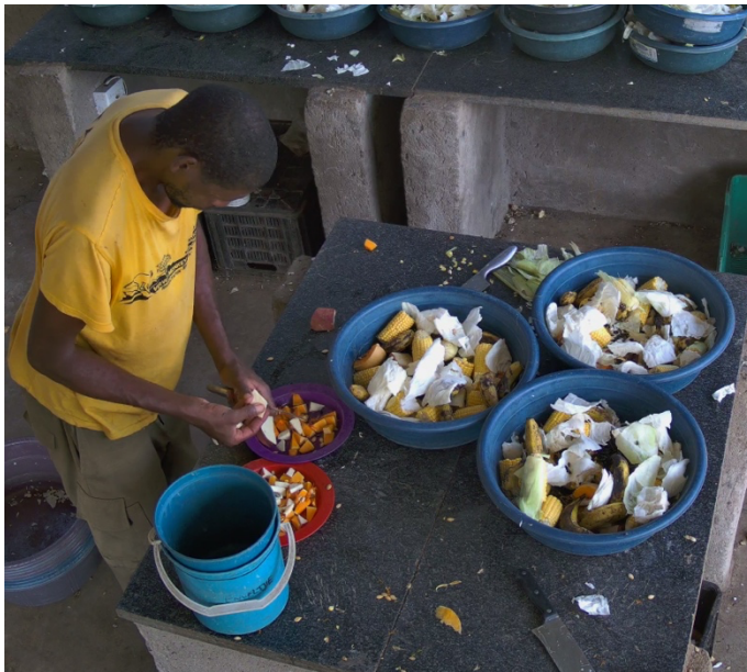
Sanctuary staff prepare nutritious produce bowls before serving this healthy meal.

Beyond the sanctuary, VMF has forged a partnership with local schools, delivering hands-on lessons about conservation that have transformed community attitudes toward these once-stigmatized “nuisance” animals. Together, these efforts not only improve health and rehabilitation outcomes for rescued vervets but also foster a shared commitment to wildlife stewardship across the region.