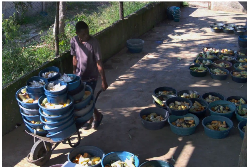
Caregivers enroute to deliver fresh fruits and nutritious vegetables to rescued vervet monkeys.

We extend our gratitude to the Forix Foundation for your transformative support of PASA's "Caring for Rescued Primates in Africa" project. Your generosity provided vital nutrition for more than six hundred apes and monkeys across our member sanctuaries, ensuring they remained healthy and safe throughout their rehabilitation. These centers offer lifetime care to primates that cannot be released, often spanning decades. The cost of food alone is immense. Your funding sustained individual animals and strengthened our collective fight against wildlife trafficking by enabling sanctuaries to maintain the highest standards of welfare.