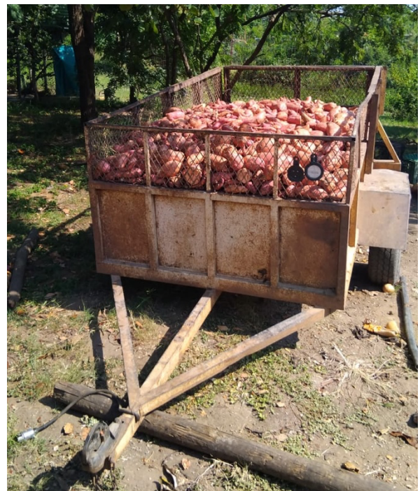
This trailer loaded with fresh vegetables captures the scale needed to keep the vervets healthy and thriving.